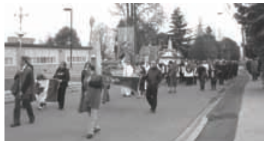
OUR LADY of FATIMA PARADE Sunday, Oct 16 th

Although the weather was cool, a wonderful